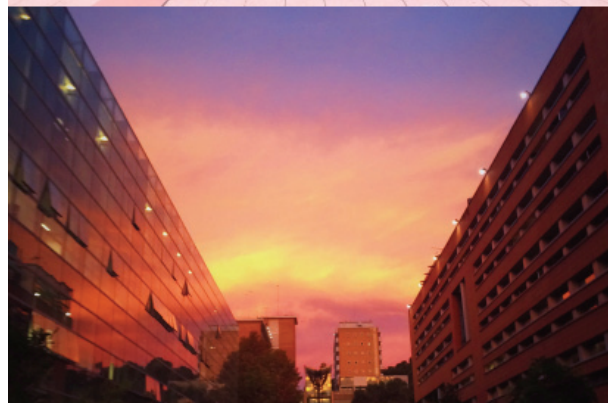
An impromptu twilight performance on UNSW's main walkway, May 2016

Singing in a choir, after all, is about finding a personal connection with the music and sharing that connection with others. When a small group of dedicated musicians combine their individual personalities into a greater whole, the results can be remarkable. Even more remarkable again is the effect of live performance; drawing on the palpable enjoyment of an audience gives the music a vitality and energy it can easily lack behind the closed doors of a rehearsal room.